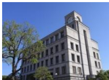
Itami City General Education Center

➔ Take the Itami Municipal Bus from any JR or Hankyu station and get off at “City Hall” or “City Hall West”. The building with the clock is on the south side of City Hall.