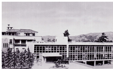
the second city hall