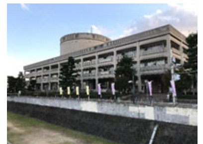
the third city hall