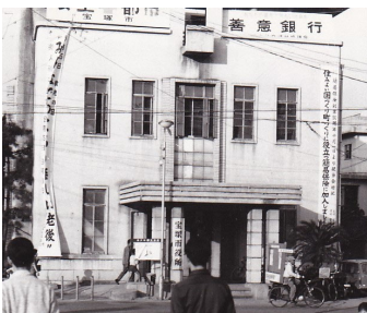
the first city hall (old Ryougen village office)

This Takarazuka city where we lives is originally Kawamo village and Miza village of the county Muko and Akura village, Kohama village, Maitani village and Yasuba village of the country Kawabe. In 1885, Kawamo village merged Yasube village and in 1889, Kawamo village, Miza village, Akura village, Kohama village and Maitani village became Kohama village of the country Kawabe. In 1951, Kohama village enforced the town plan and became Takarazuka town. In 1954, Takarazuka city established with Ryogen village and Takarazuka town. After that, In 1955, Nagao village and Nishitani village were incorporated and Kounoike, Aramaki and Ogino were transferred from Takarazuka city to Itami city and became the current city area.