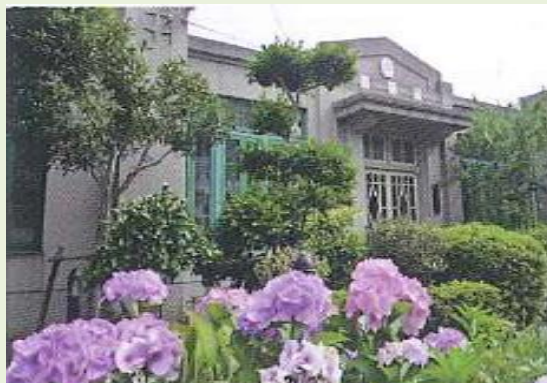
Shinbu Alumni Association Building